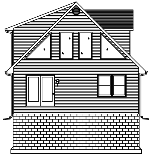
LEFT END ELEVATION