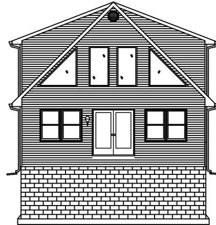
RIGHT END ELEVATION